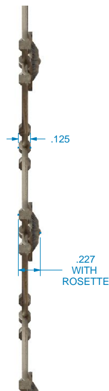
SAMPLE SHOWN IN DOOR